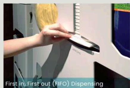
First in, First out (FIFO) Dispensing