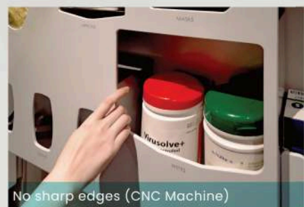
No sharp edges (CNC Machine)