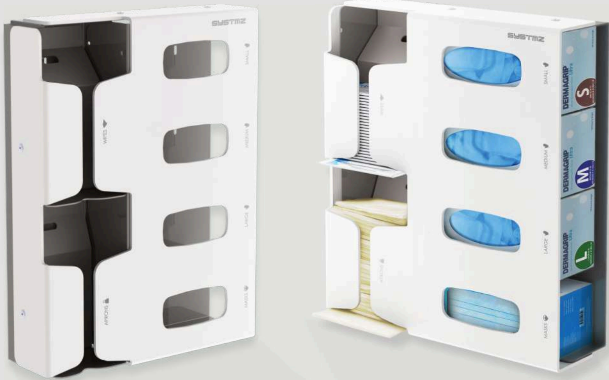
WD-SERIES designed and manufactured in Singapore